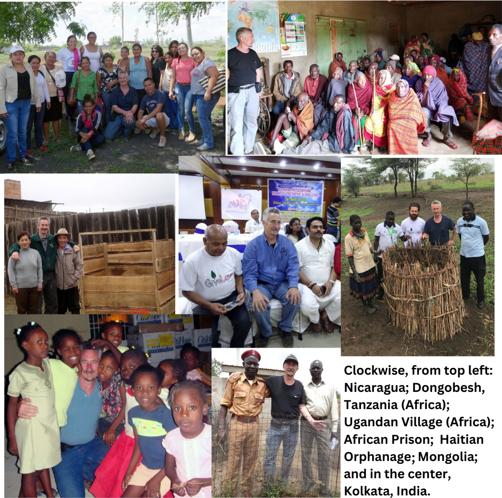
Clockwise, from top left: Nicaragua; Dongobesh, Tanzania (Africa); Ugandan Village (Africa); African Prison; Haitian Orphanage; Mongolia; and in the center, Kolkata, India.