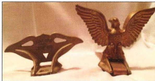
Bronze Models are also Available