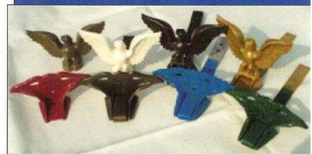
We Powder Coat Our Snowguards Any Color You Need