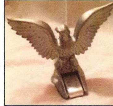
Original Eagle Model